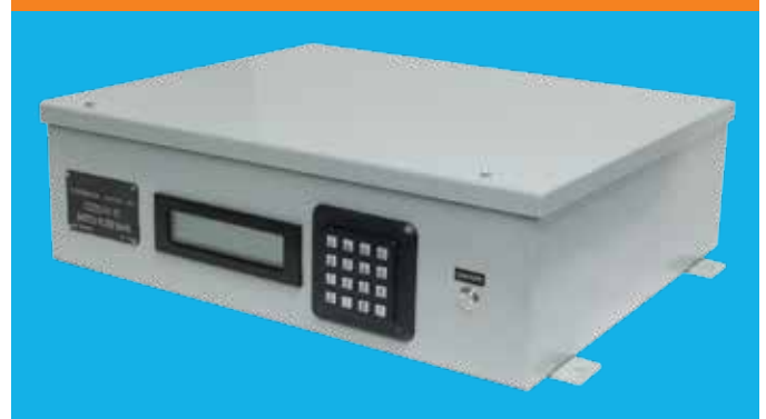
Integrated Assemblies: Switch Filter Bank