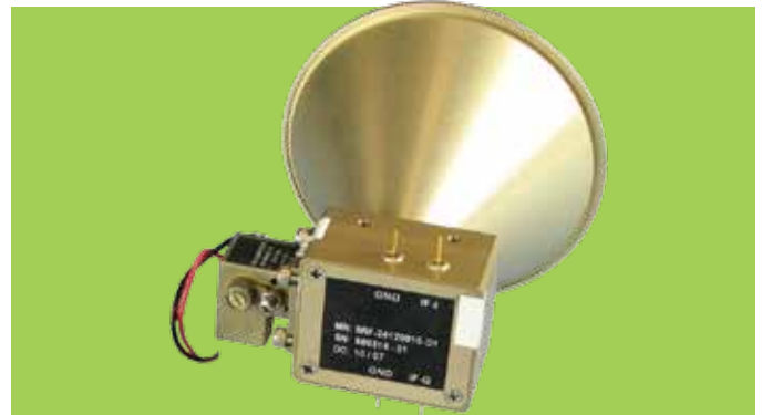
RF mmW SENSORS (SRF Series)