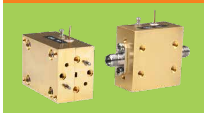
Full Waveguide Band Amplifier Series (AFB)