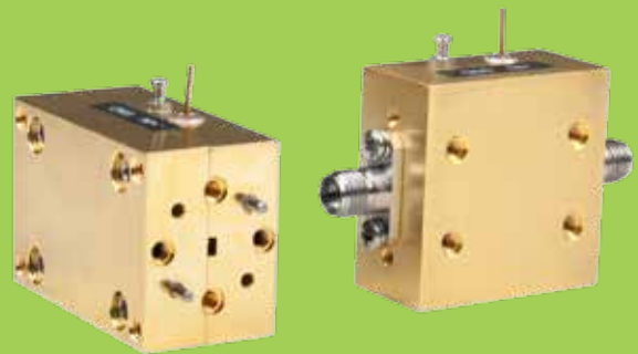
Full Waveguide Band Amplifier Series (AFB)