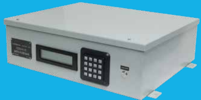
Integrated Assemblies: Switch Filter Bank