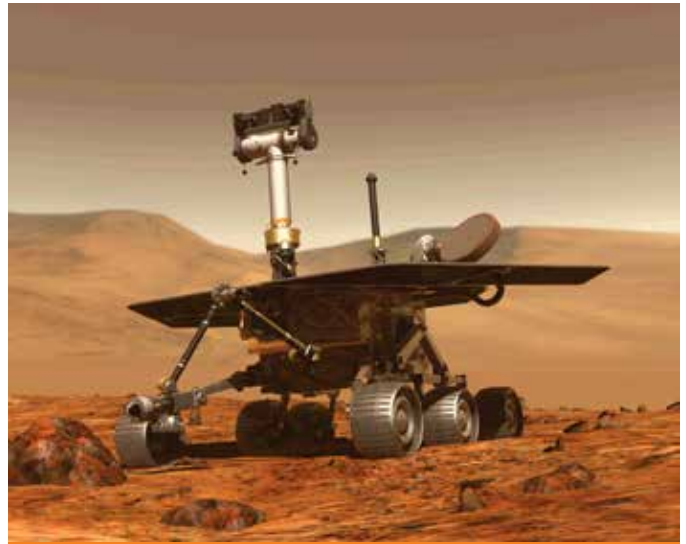
Mars Exploration Rover