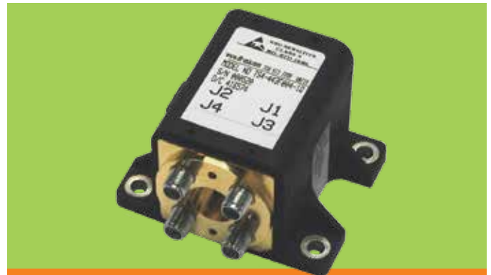
DPDT Transfer Switch